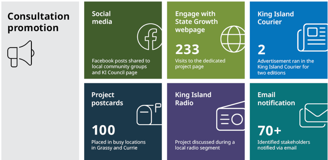
Figure 1: Consultation promotion

Key stakeholders were consulted through dedicated workshops and one-on-one meetings, while the broader community were consulted via local drop-in sessions and an online survey. Stakeholders were also able to provide feedback through a dedicated project phone line and email address. A summary of consultation promotion and activities is provided in Figures 1 and 2.