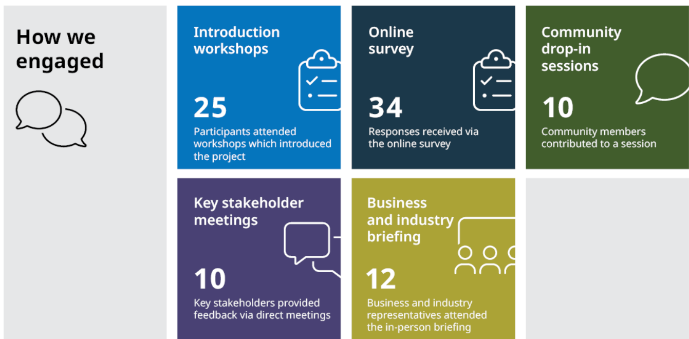
Figure 2: Consultation reach